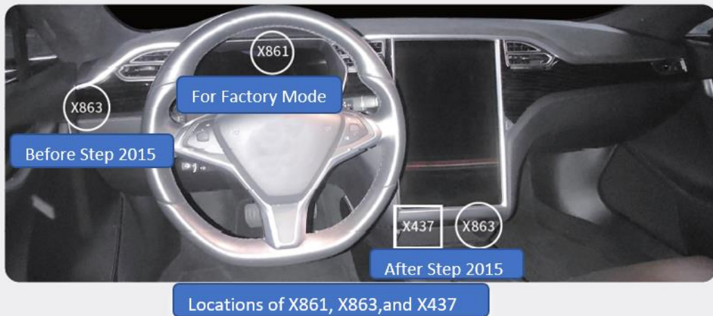
Locations of X861, X863, and X437